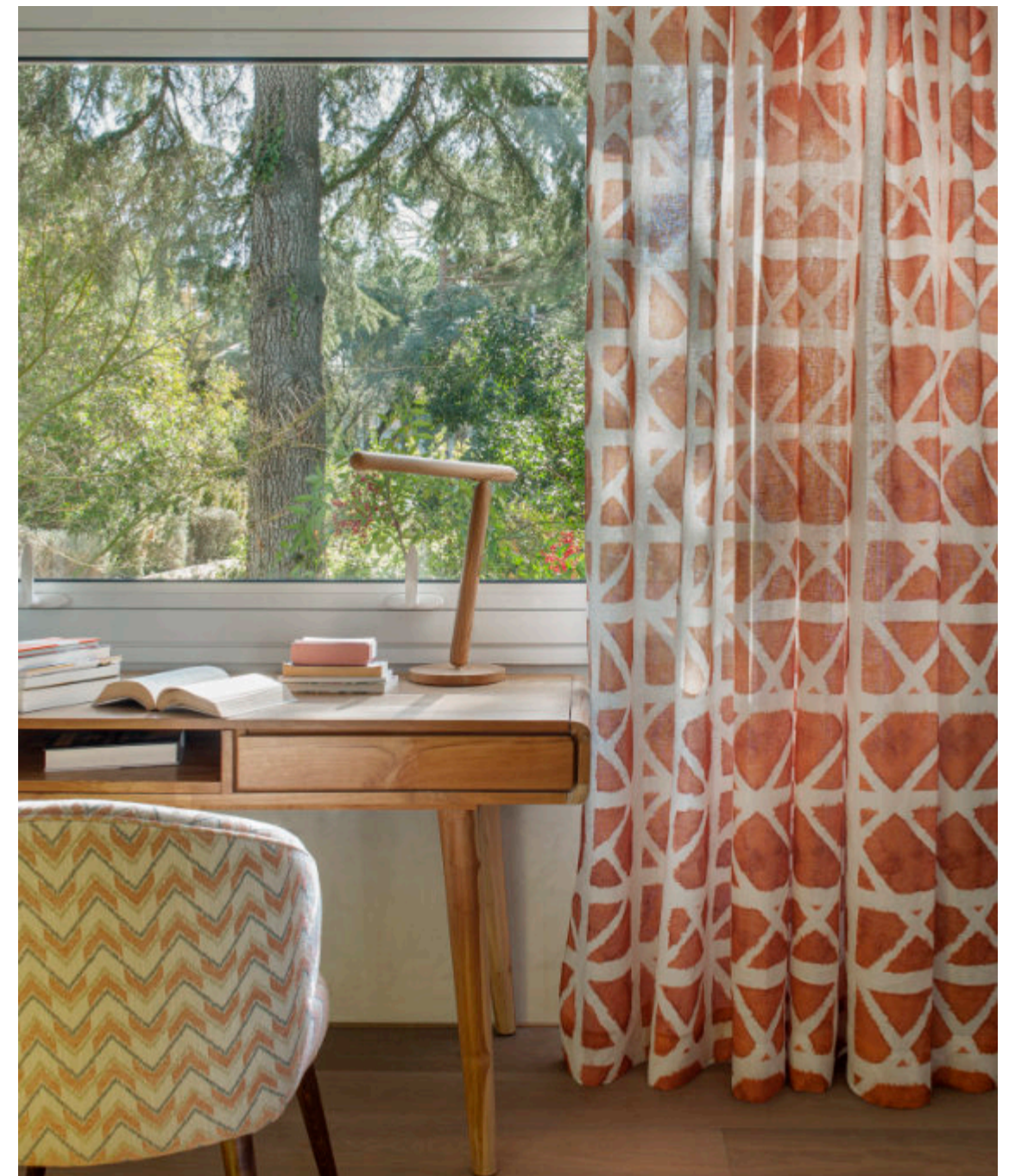
Curtain Panay 08, Chair Cebu 02.