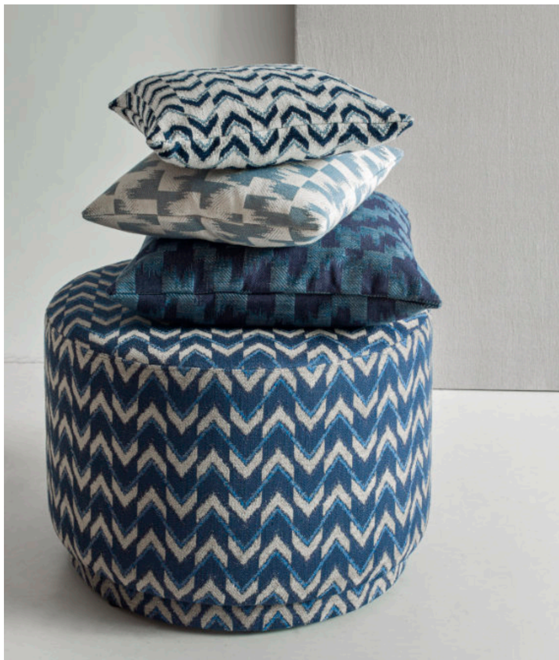
Puf Cebu 14, Cushions Yakan 24, Yakan 04, Cebu 04.