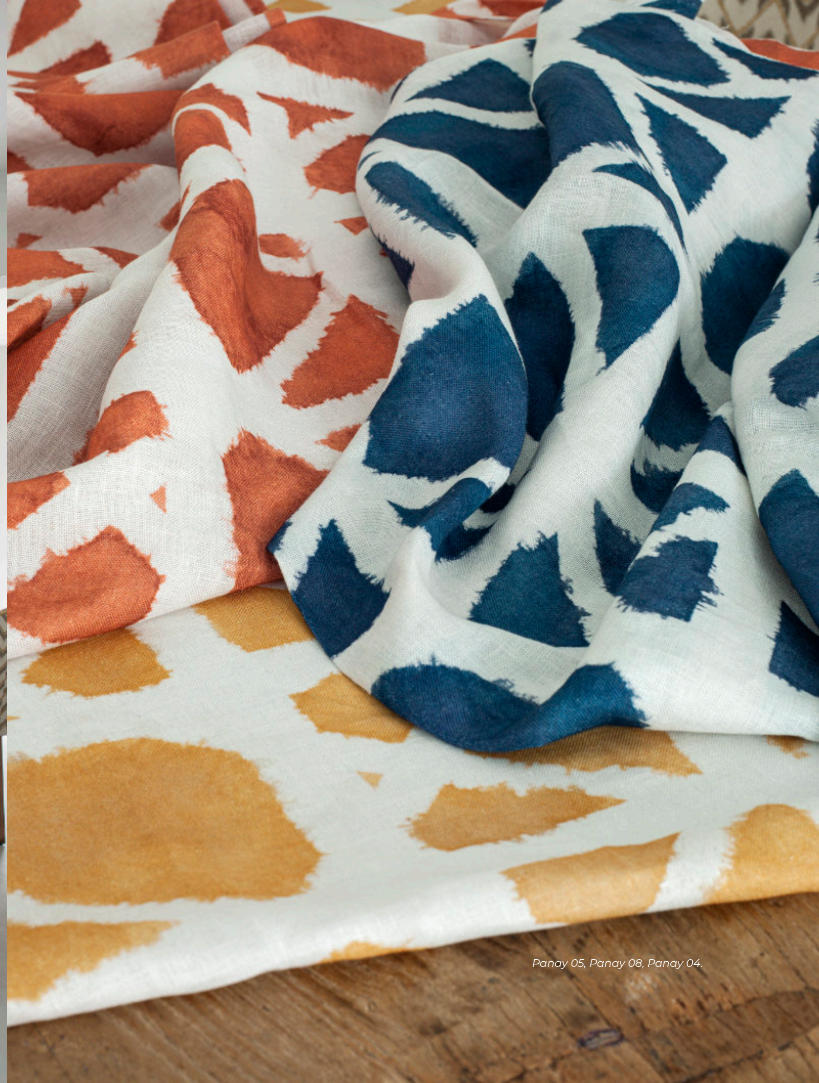
Panay 05, Panay 08, Panay 04.