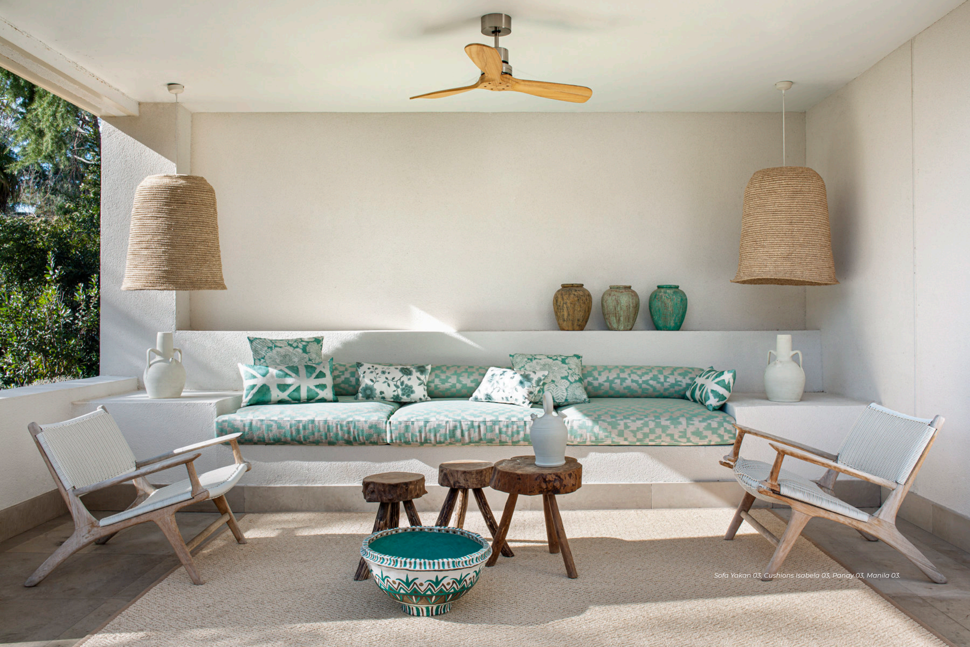
Sofa Yakan 03, Cushions Isabela 03, Panay 03, Manila 03.