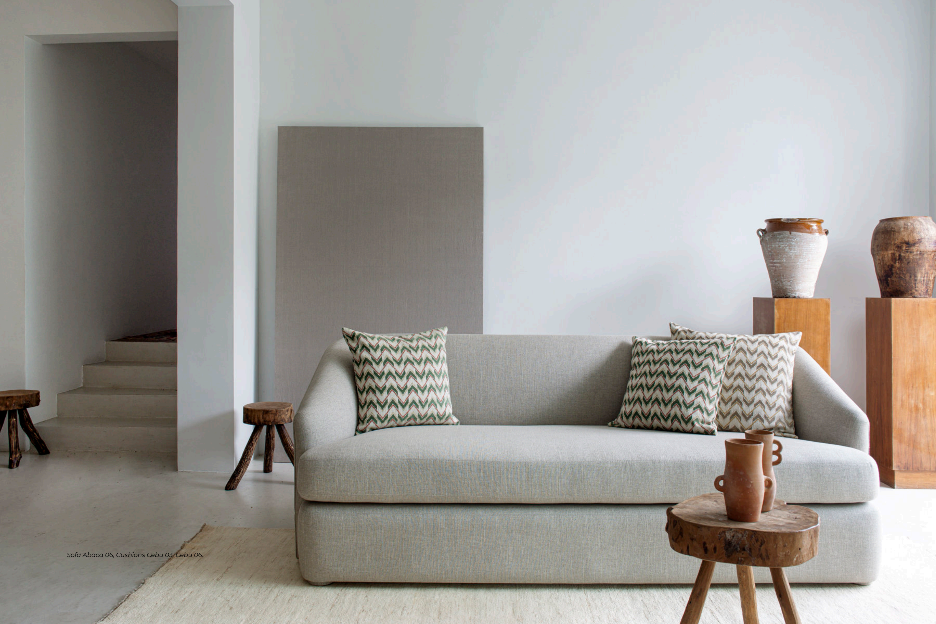
Sofa Abaca 06, Cushions Cebu 03, Cebu 06.