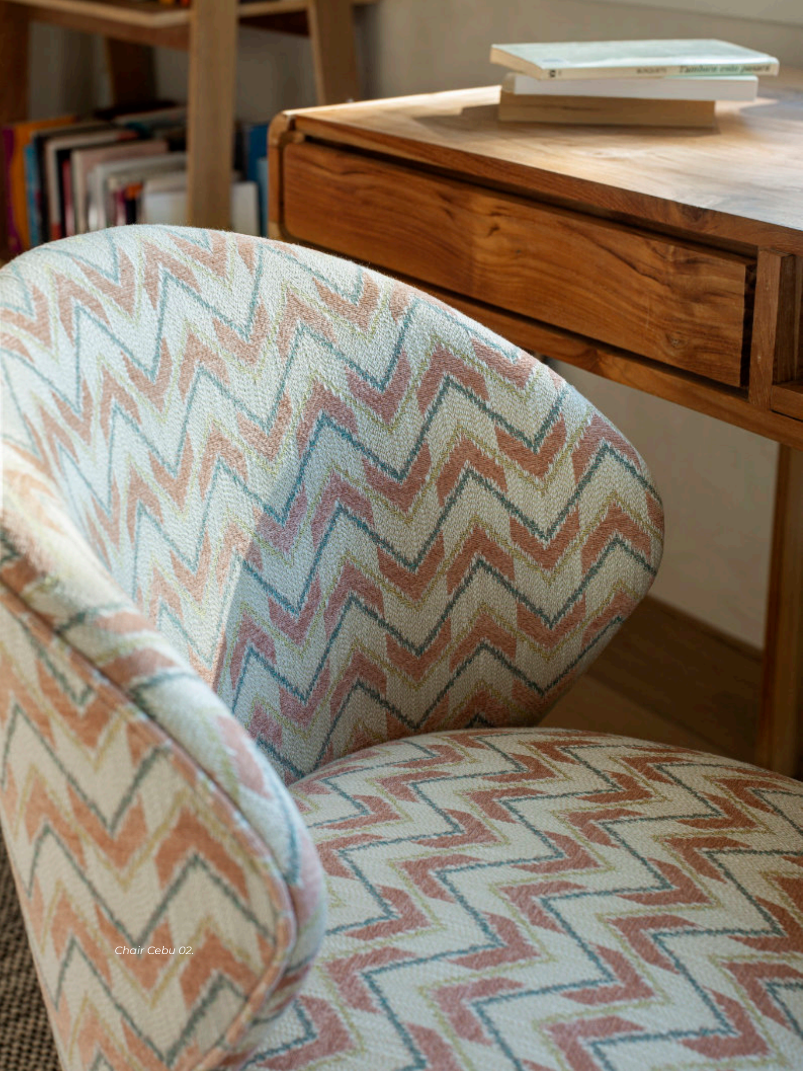
Chair Cebu 02.