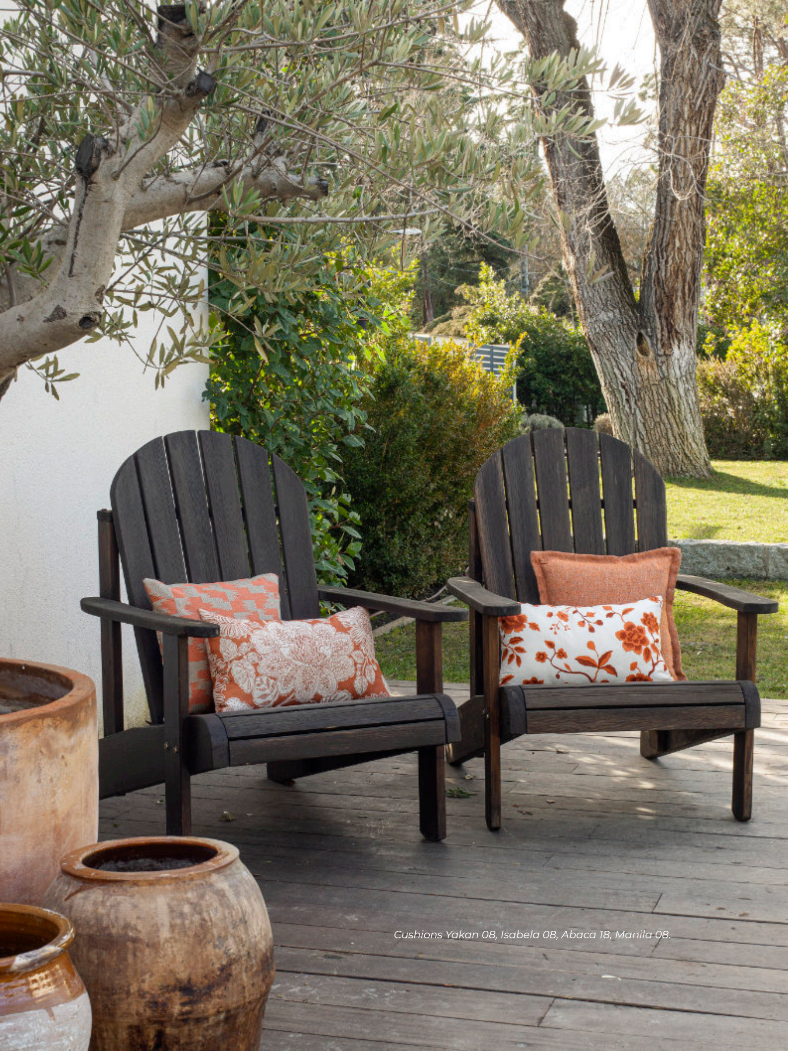
Cushions Yakan 08, Isabela 08, Abaca 18, Manila 08.