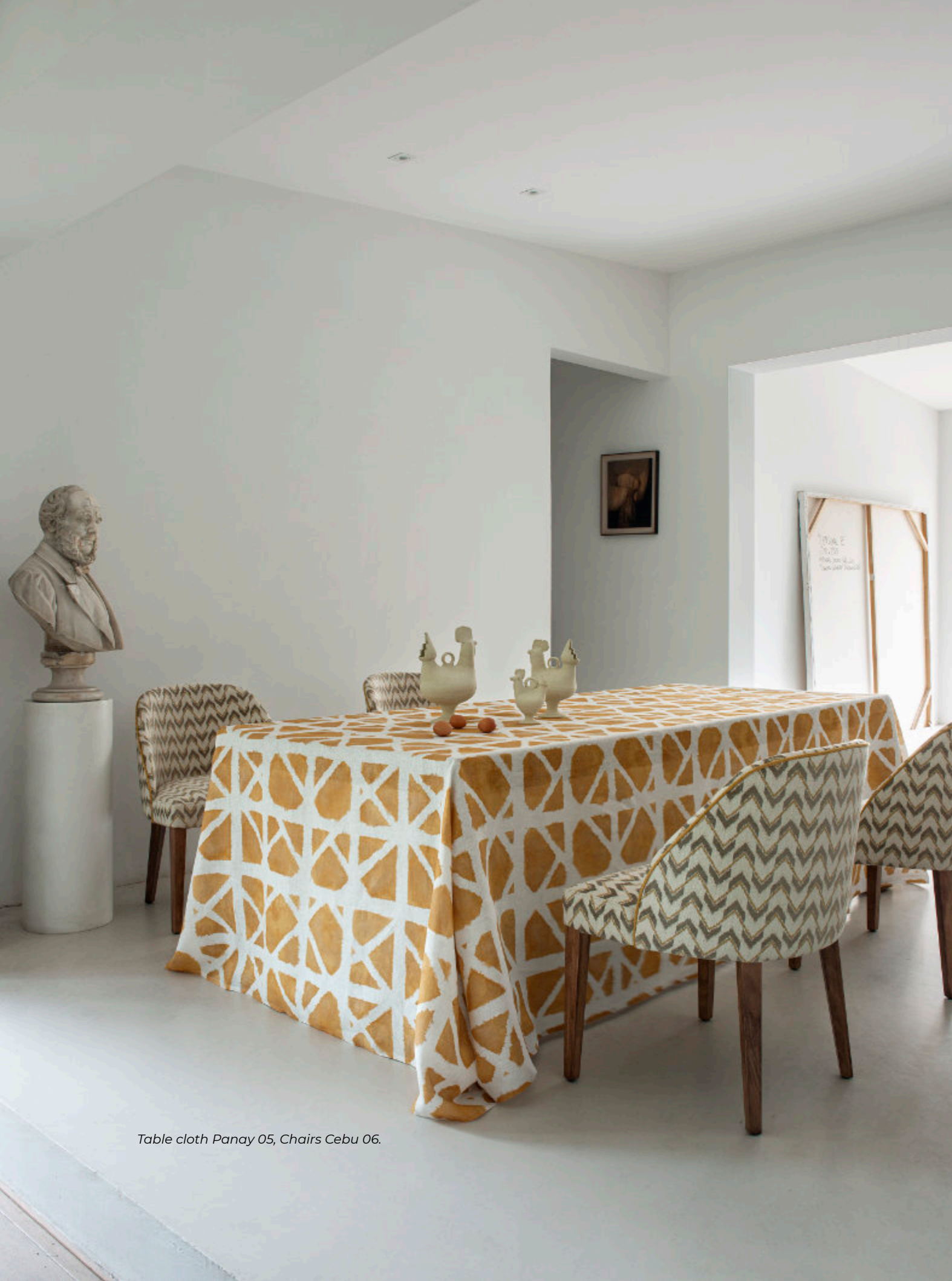
Table cloth Panay 05, Chairs Cebu 06.