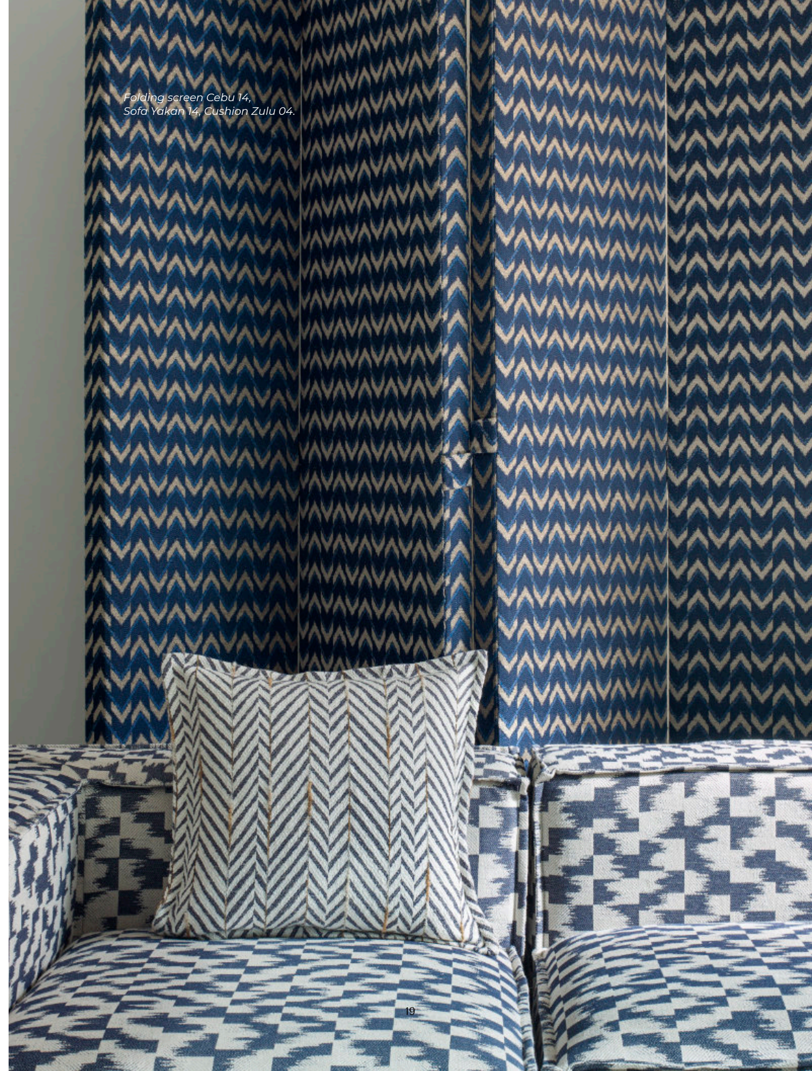
Folding screen Cebu 14, Sofa Yakan 14, Cushion Zulu 04.